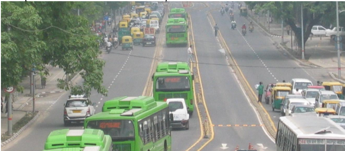
FIGURE 1 BRTS Corridor in Delhi

The solution lies in the ability to predict the performance of a BRTS system based on its planning and design details. One could then evaluate results against a list of key identified indicators. This paper reviews and compares various BRTS system designs. The evaluation will use a spreadsheet tool to model and quantify performance of different BRTS design alternatives against identified indicators. The results are then compared against current assumptions and theories around what comprises an ‘ideal’ BRTS.